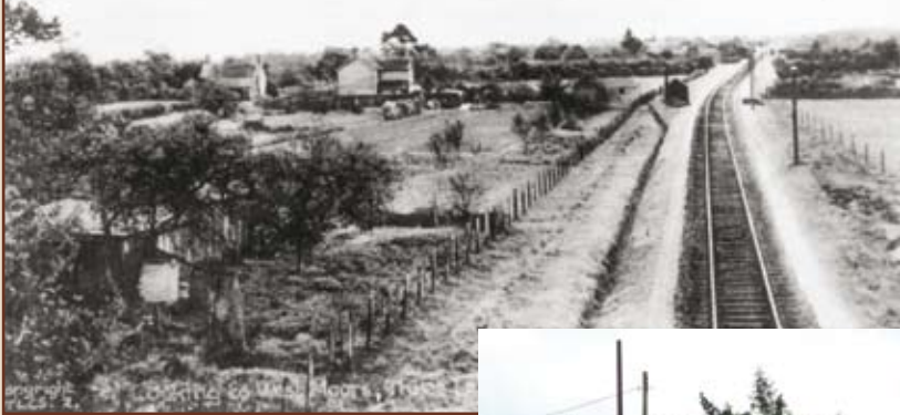
Early 1900's looking south

The old photo above was taken from the Railway bridge on the Horton Road, since demolished and looking south.