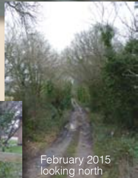
February 2015 looking north