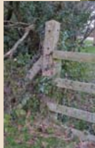
February 2015 Railway evidence.